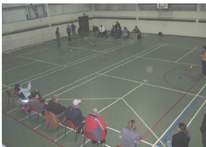
Over view shot of Participants from Rehab Care Carlow and Rehab Care Kilkenny Inter service Boccia sessions 20th March 2009 Old Leighlin Community Centre