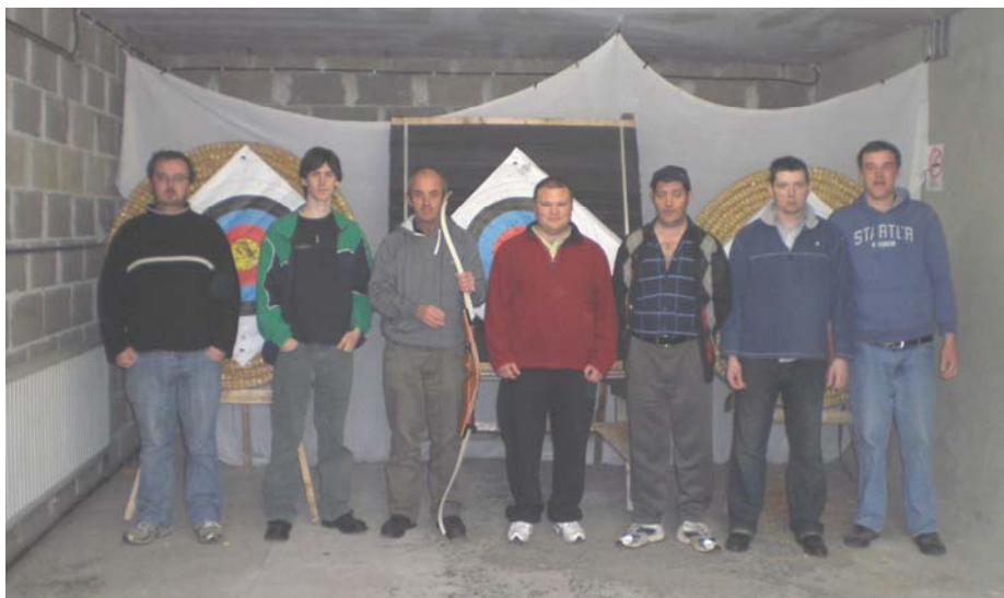
Participants that took part

“It got the mind and body in sink together it made you think of what you are doing....there’s more to the sport than you think, thank you”