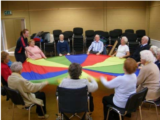
Participants from Askea Day Care Centre