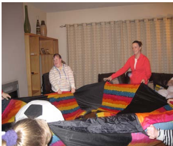
Participants taking part in Parachute games Residential activity sessions around Carlow Town

Sports Inclusion Disability Officer and management of the Delta Centre organised a pilot initiative with three residential houses around Carlow Town. The disability officer attended each house one evening a week for one hour delivering activities. The pilot is due to finish in early April. Activities that individuals participated in included; chair aerobics, modified toning exercise, new age kurling, target throwing, etc.