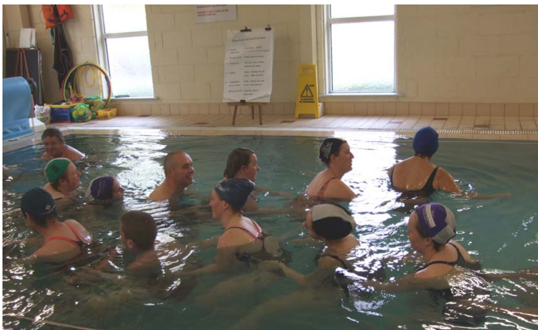
Above: Some of the participants experiencing the Halliwick Swimming games in Holy Angels Pool on the 22nd of October 2008