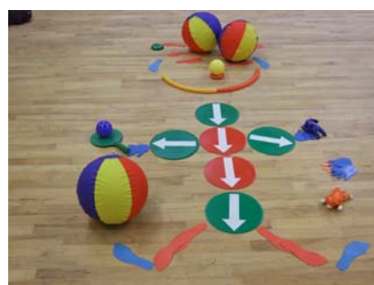
Holy Angels Staff with their bag of equipment

Below: An Example of Using the equipment in a creative manner