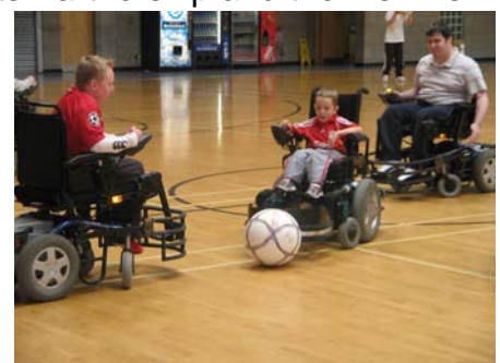
Above: Participants at the Powersoccer FAI Day with Muscular Dystrophy Ireland

This project began on the 16th October 2008 and ran for 5 weeks. This project will be evaluated in early 2009. Feedback from participants has been very positive.