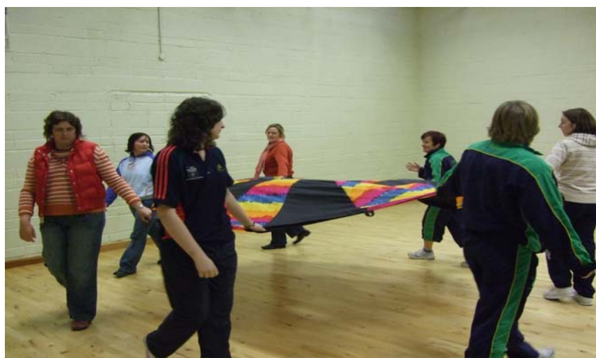
Some of St Laserians Staff, School Hall