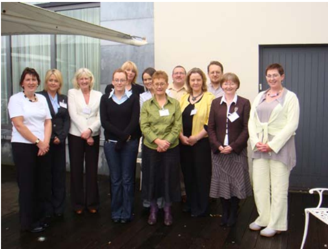
SIDO pictured in front with members of the organising committee for the Special Needs Conference

Regularly attend regional meetings organised by disability organisations around Carlow and the South East to promote the work of the Sports Inclusion Disability Officers and the Sports Partnership. Have met with various state and voluntary organisations to promote a collaborate approach to the social inclusion of disability and sport / physical activity. Organisations include; Down Syndrome Ireland, Irish Association for Spina Bifida and Hydrocephalus Ireland, Spinal Injuries Ireland, HSE, Special Olympics Ireland, People with Disabilities Ireland, Disability Federation of Ireland, Paralympic Council of Ireland, Cerebral Palsy Sport Ireland, Irish Wheelchair Association amongst others.