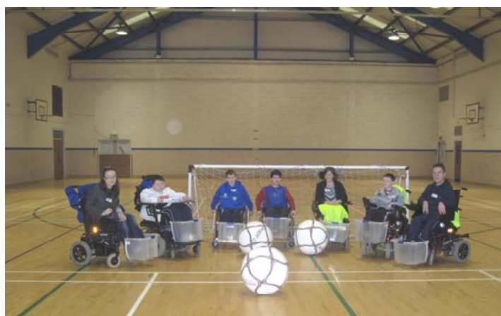
Participants at the first Power Chair Football South East Regional Club